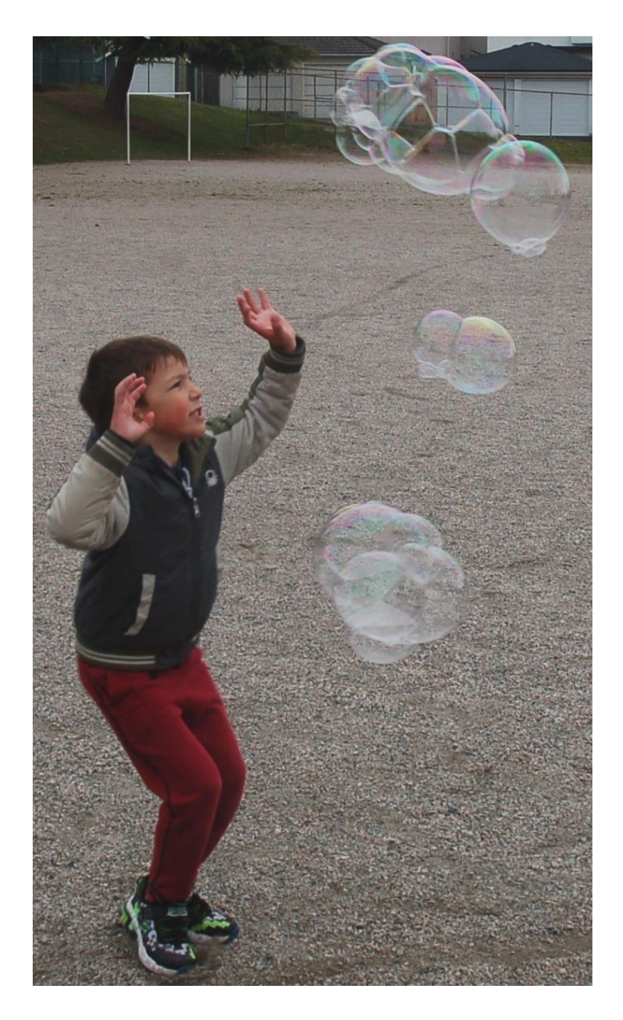
" u " for up, up, up...plus