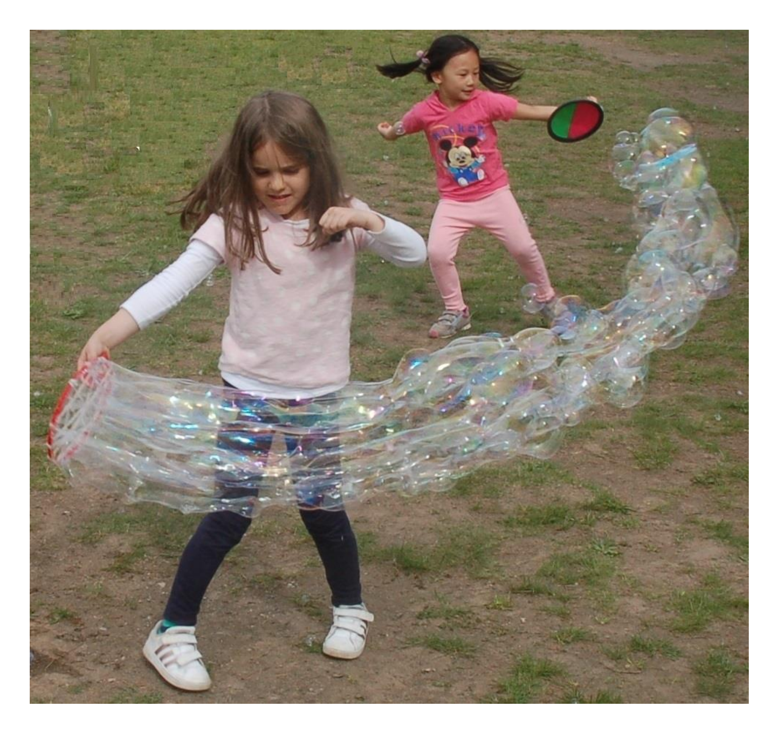
Added together you get bubbles for creating and catching.