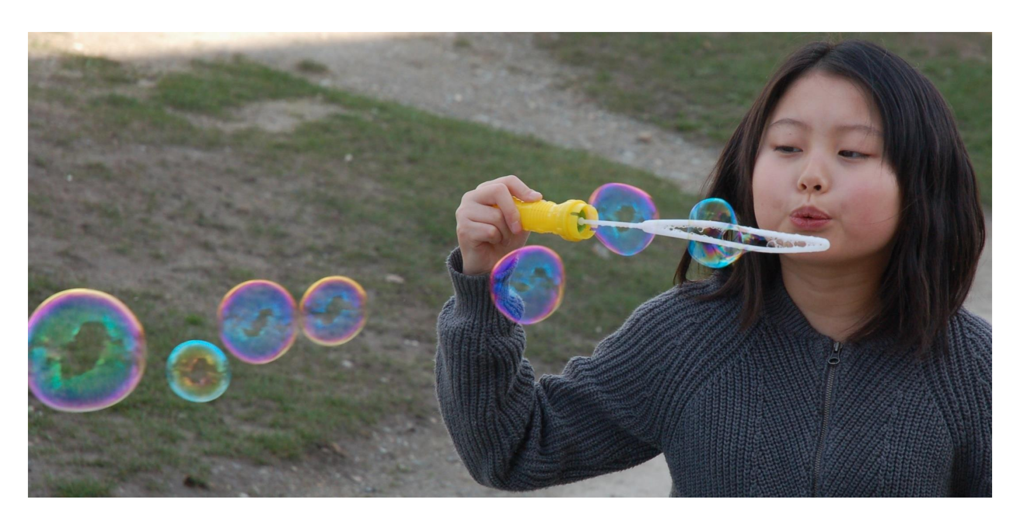
" b " for beautiful...plus