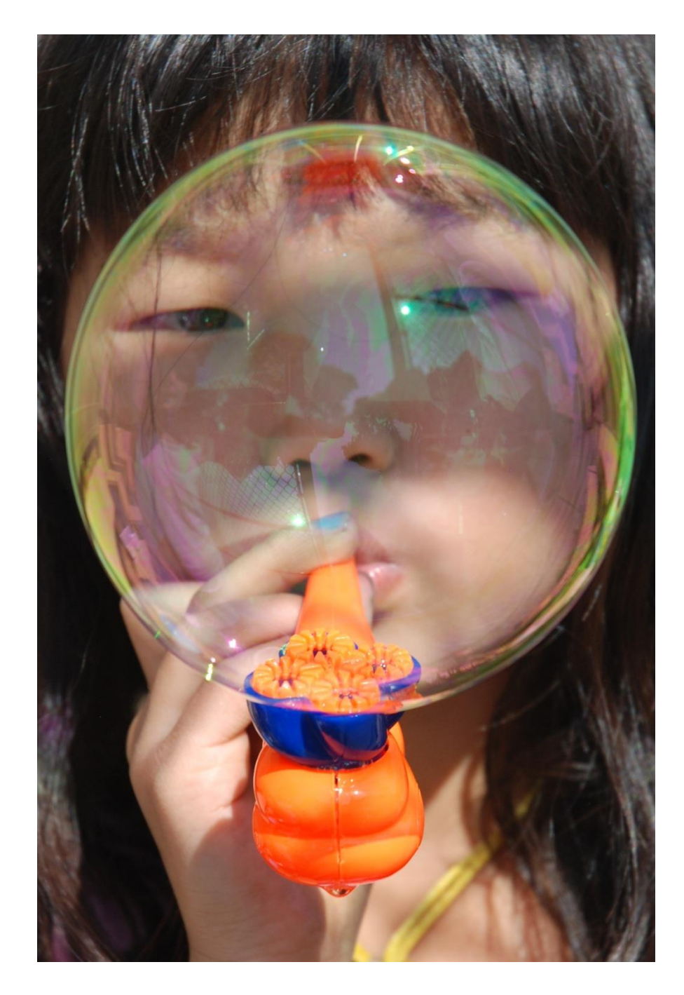
" b " for big...