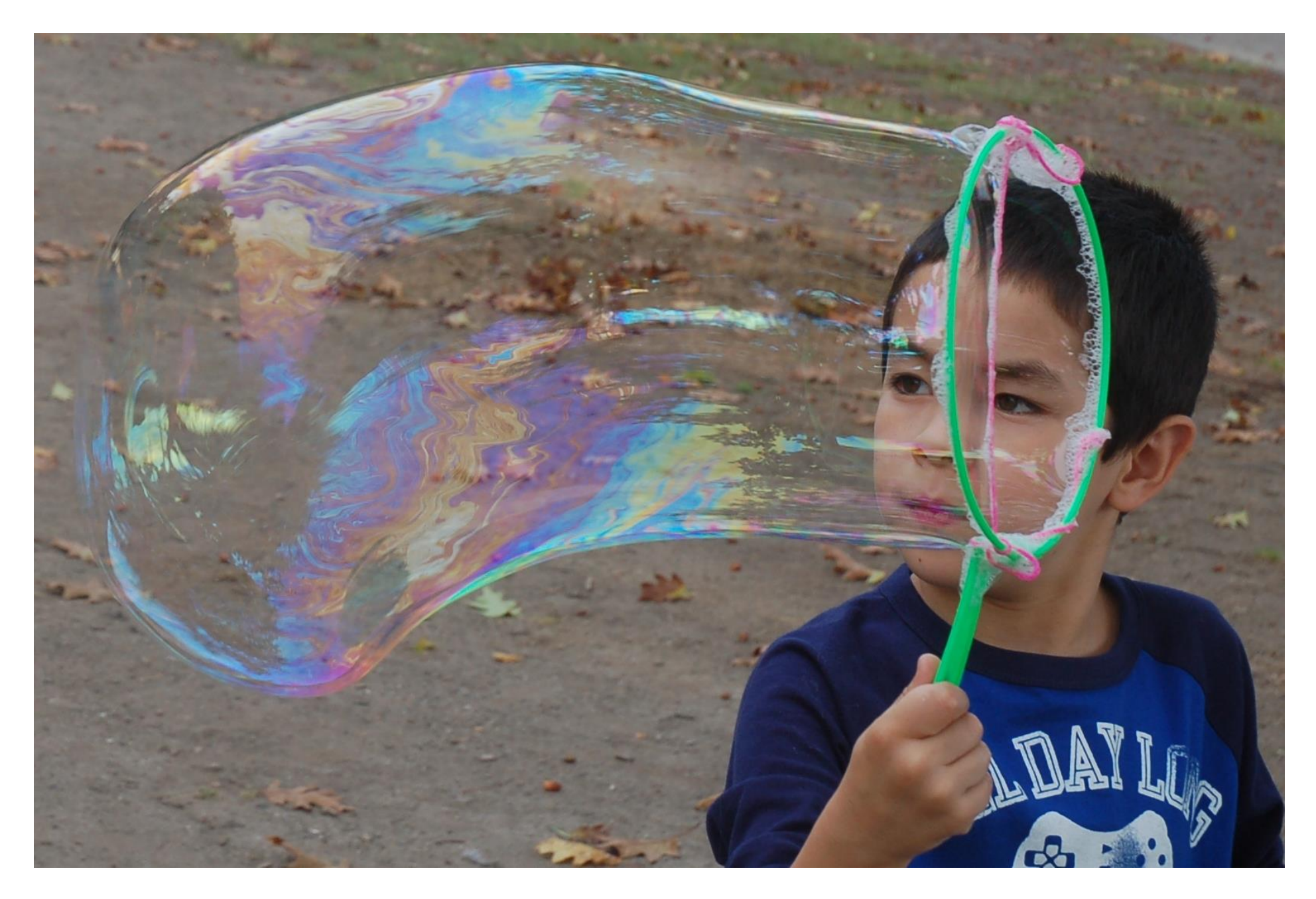
"I" for long...