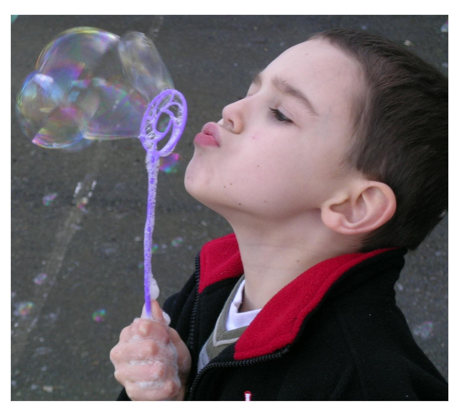
" s " for soapy.