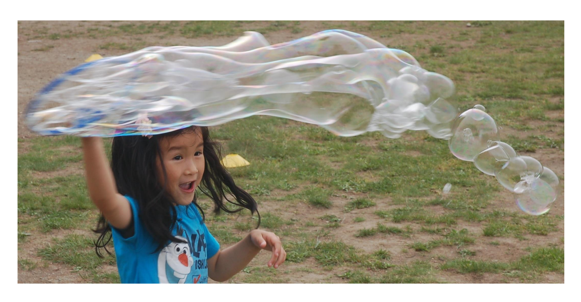
"e" for entertaining...plus