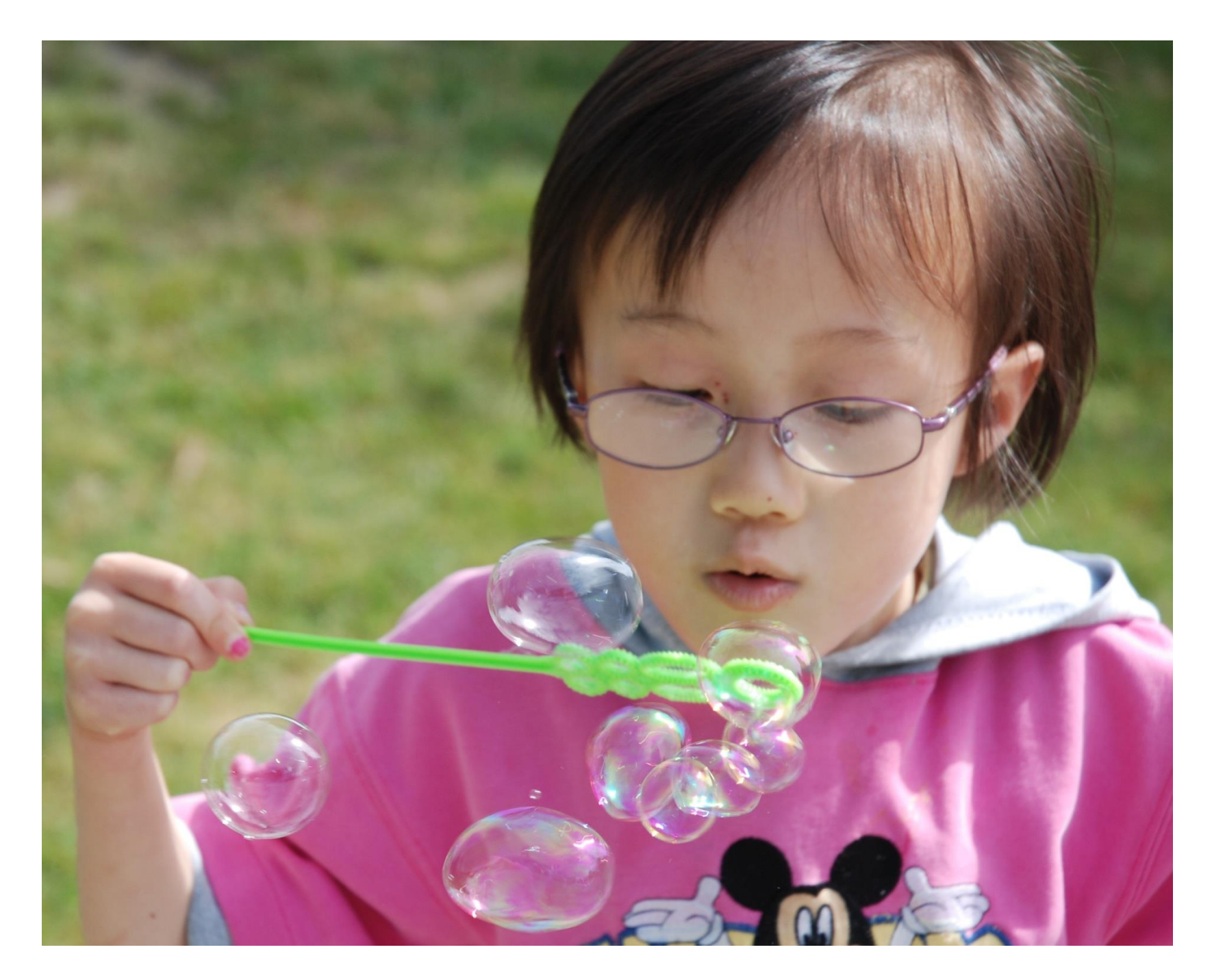
Add these letters together: " b " for blow...plus